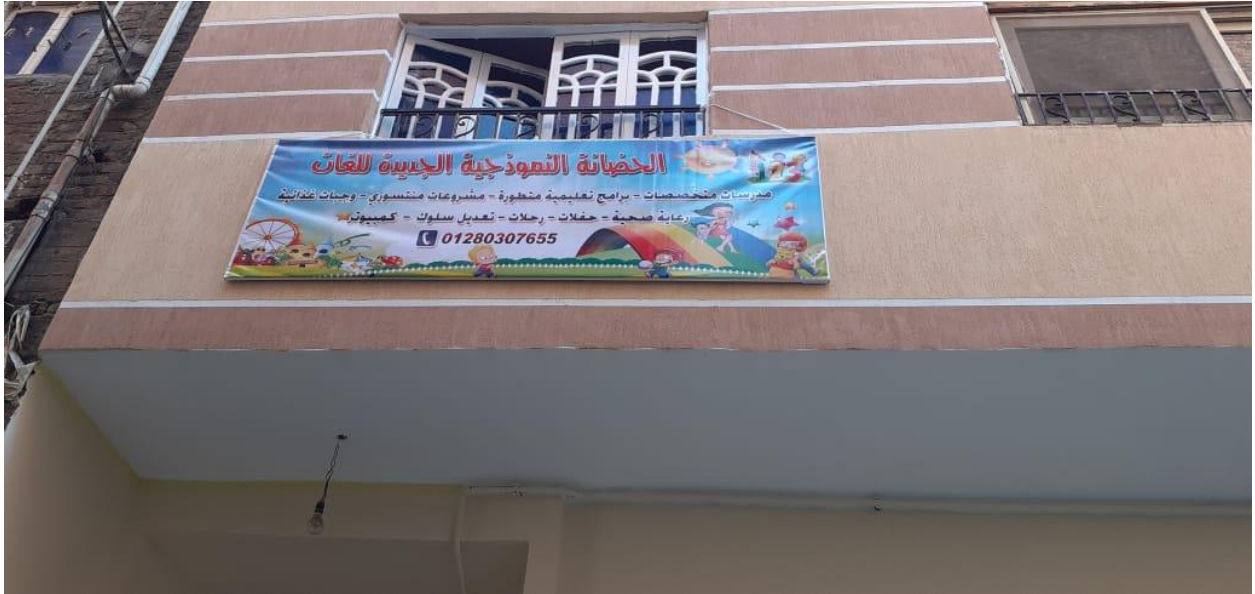
Entrance after finishing