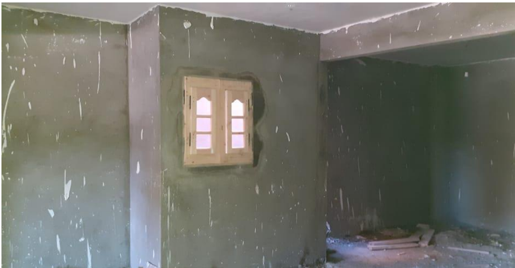
Early Finishing stage

Expecting to start welcoming children this week